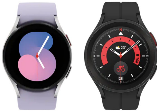
Samsung Galaxy Watch5/Watch5 Pro Buy One Get One $430 off 3