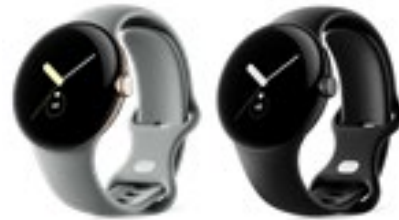
Google Pixel Watch Buy One Get One FREE 4