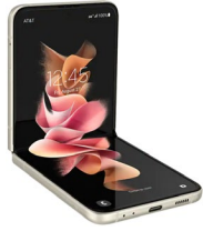
Samsung Galaxy Z Flip3 5G $5/mo. 2